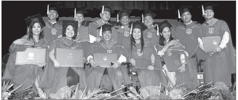
Twelve law professors of the University of the Cordilleras were conferred the degree of Master of Laws (LL.M.) by the San Beda College on June 22, 2013, at the SBC campus in Manila. UC's program to upgrade its resources and expertise in the field of legal education, is a long-term commitment to the standard bearer of UC academic offerings, namely the UC College of Law. (UC)

The CHED program aims to strengthen and enhance the professional growth and